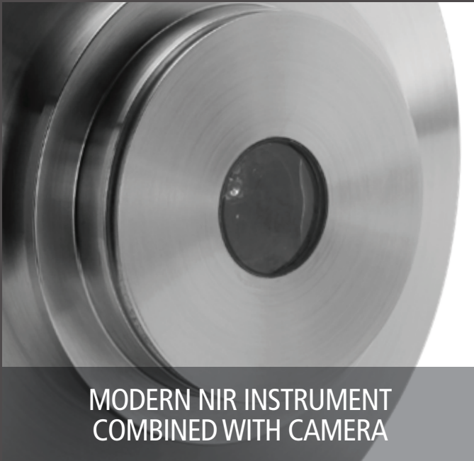
MODERN NIR INSTRUMENT COMBINED WITH CAMERA